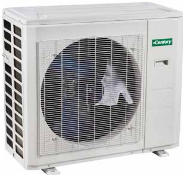
12,000,18,000, 24,000, 30,000, 36,000,48,000 BTUH

1 Oil traps must be installed every 10 feet (3m) when outdoor unit is installed above indoor unit.